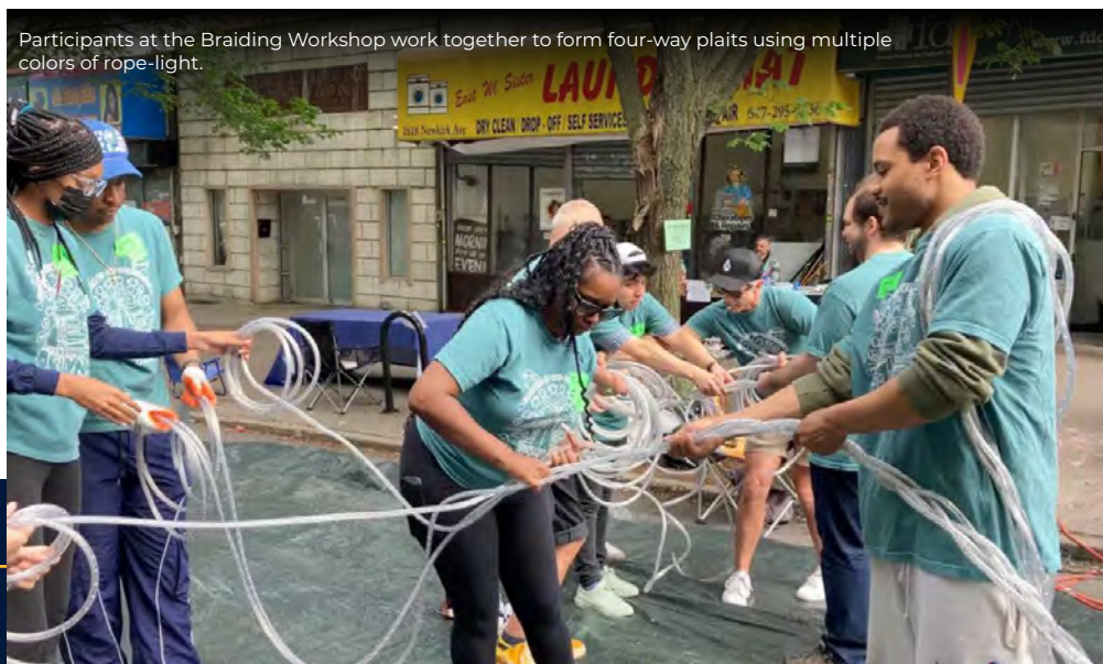
Participants at the Braiding Workshop work together to form four-way plaits using multiple colors of rope-light.