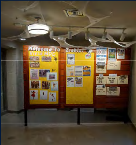
After: Recreation staff utilize the lighting fixtures in their holiday decorations.