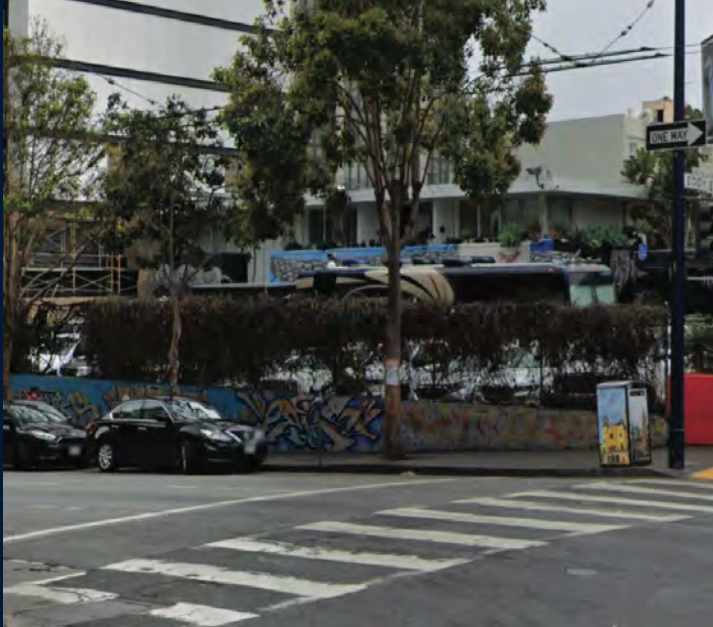
BEFORE: View of entire street corner with the chain link fence and overgrown vegetation.

A deteriorating chain-link fence outside the Phoenix Hotel was replaced with an illuminated Corten steel screen, complete with narrow-beam grazing lights and accent floods. The transformation dramatically improved the safety and aesthetics of a previously dangerous corner.