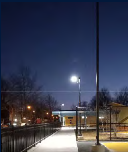
Pedestrian scale walkway lighting to create a "park-like" atmosphere. Fixtures are on throughout the night, on motion sensors, dimmed to 50% until someone enters then light level rises to 85%. Exterior exit door lights are shielded, wall mounted, "sconces" used instead of typical wall-packs.