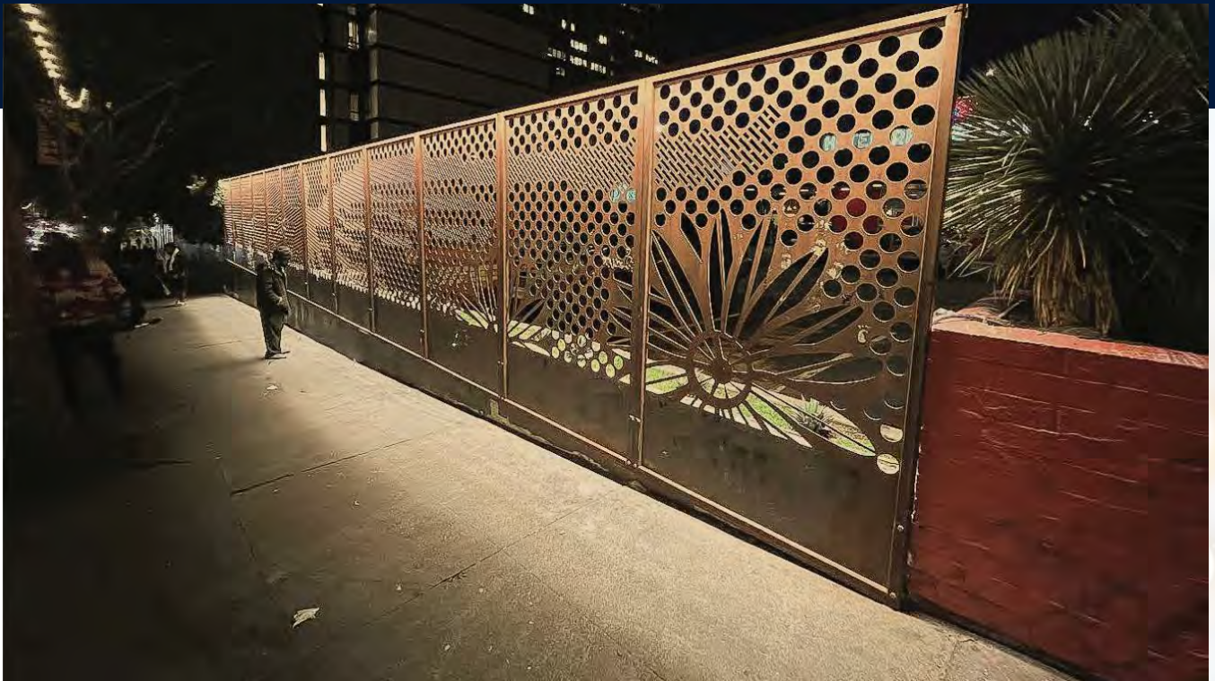
AFTER: The lighting creates an illuminated vertical backdrop to the side walk while also lighting it.

Each of these projects demonstrates how lighting can be more than decorative—it can foster safety, uplift culture, and reflect community pride. The 2025 Light Justice NOW Award winners show that when designers engage authentically with their communities, lighting becomes a tool for transformation.